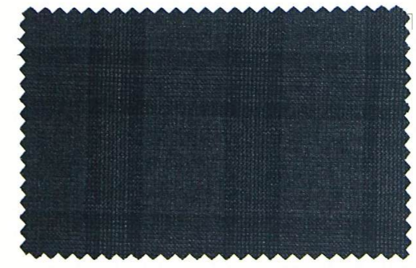
609 - 847 / 1000 100% Wool 150cm 280g Grey