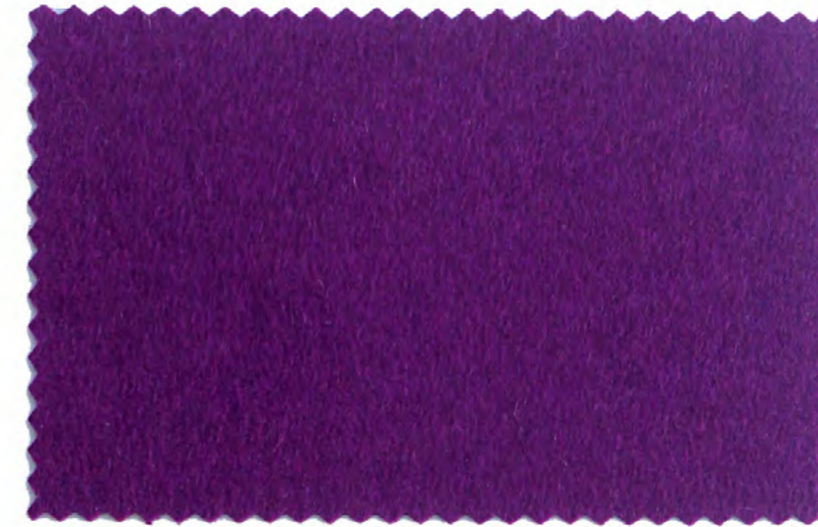
608 - 965 / 3000 100% Cashmere 150cm 540g Pansy