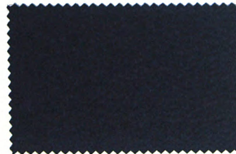
608 - 991 / 3000 100% Cashmere 150cm 480g Navy