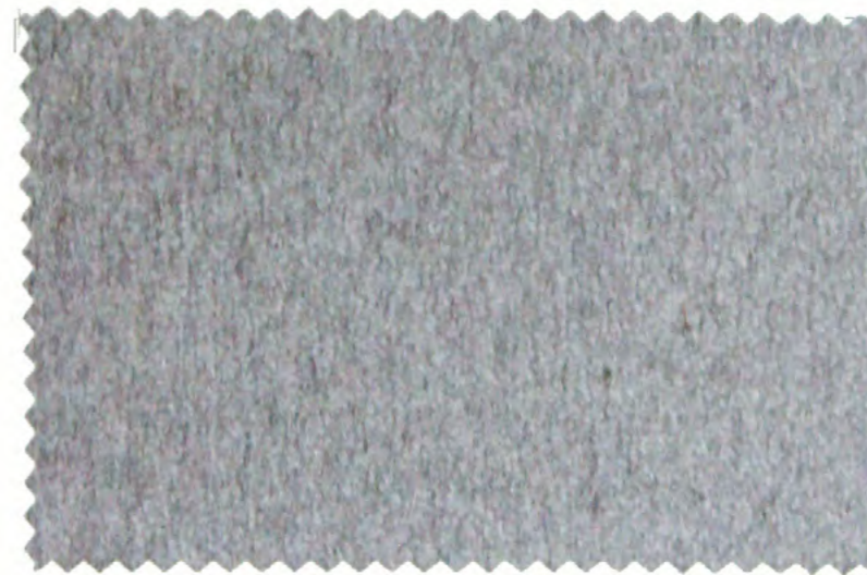
608 - 993 / 3000 100% Cashmere 150cm 480g Light Grey