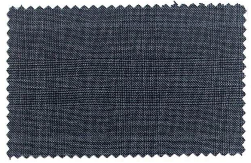
609 - 846 / 1000 100% Wool 150cm 280g Grey