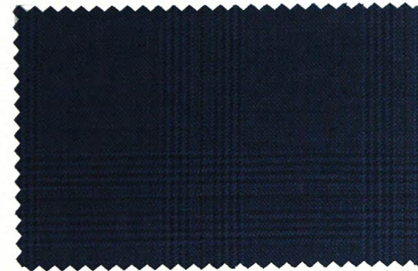
651 - 752 / 1200 100% Wool 150cm 250g Navy / Purple