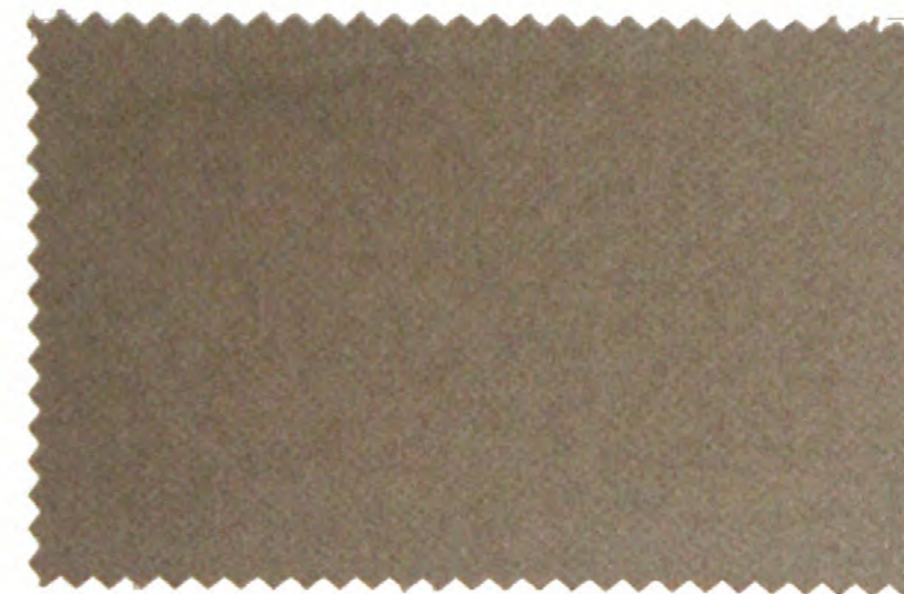
608 - 962 / 3000 100% Cashmere 150cm 480g Tan