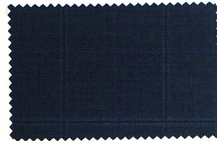
621 - 098 / 900 100% Wool 150cm 260g Blue / Purple