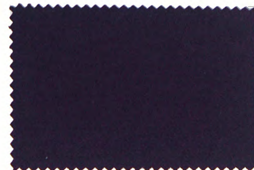
608 - 966 / 3000 100% Cashmere 150cm 540g Burgundy