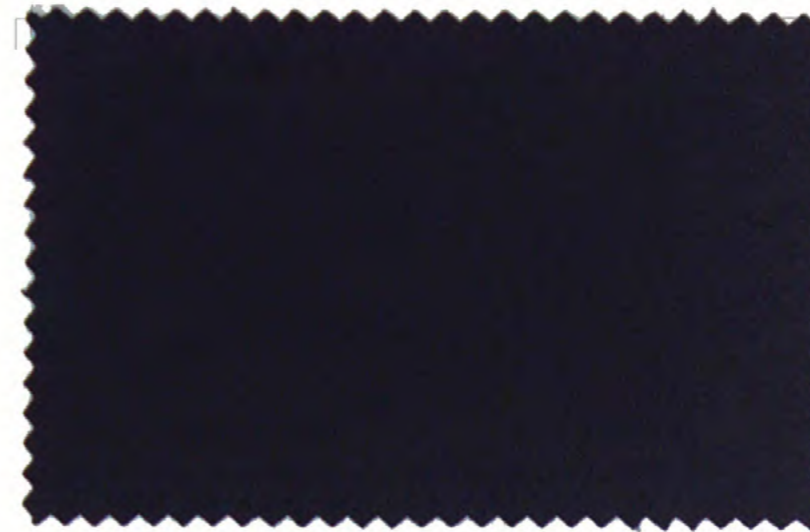
608 - 953 / 3000 100% Cashmere 150cm 480g Royal Blue