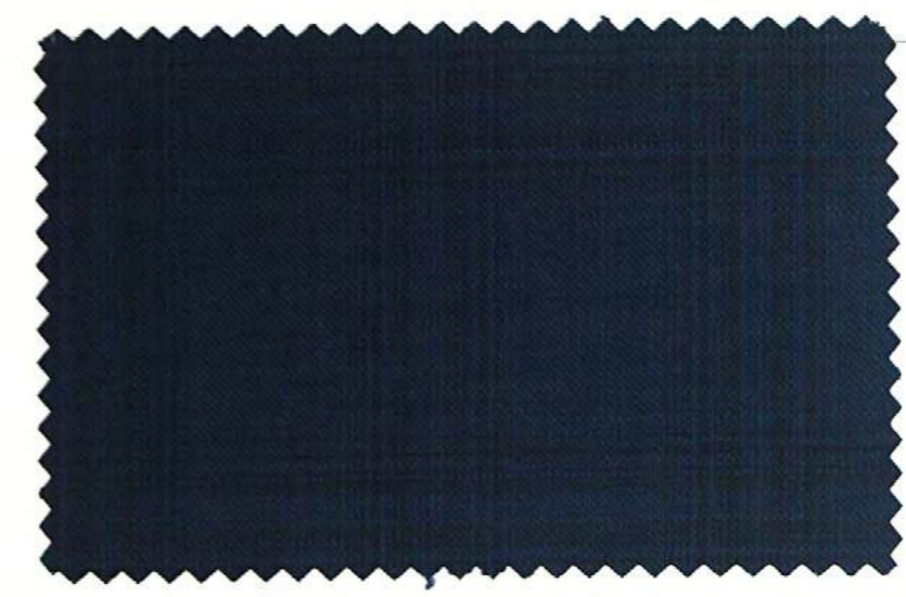
609 - 848 / 1000 100% Wool 150cm 280g Navy