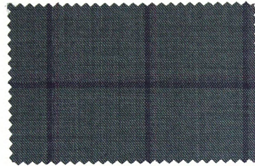
651 - 788 / 1000 100% Wool 150cm 250g Light Grey / Purple